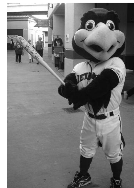
Jethawk's mascot "Kaboom"